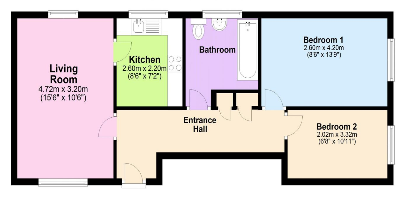
Flat Approx. 54.7 sq. metres (589.1 sq. feet)